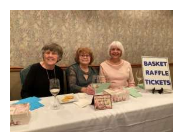
The Basket Committee