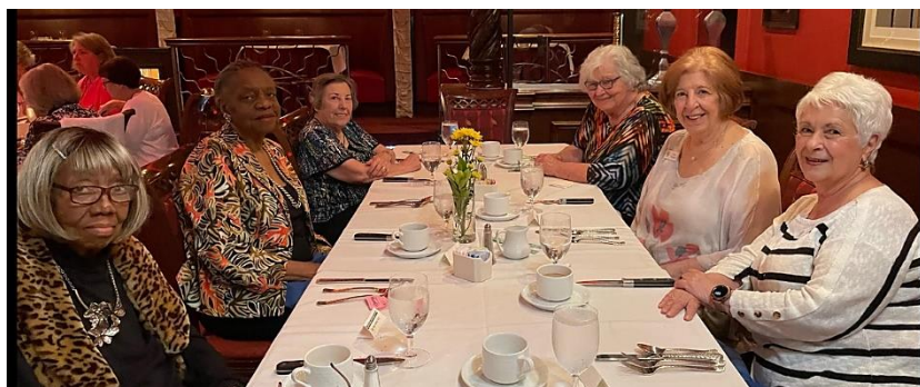
Enjoying the Spring Luncheon at Russell's Last Year