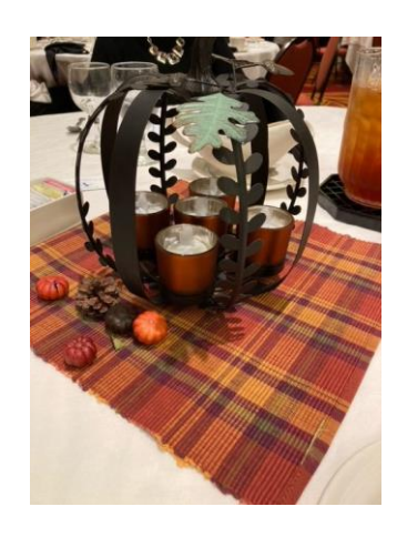
We honored our past presidents and long term members.