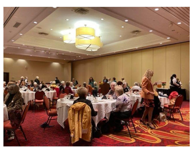
Great time was had by almost 100 of us.

Join us for the next event and your picture may be on this page.