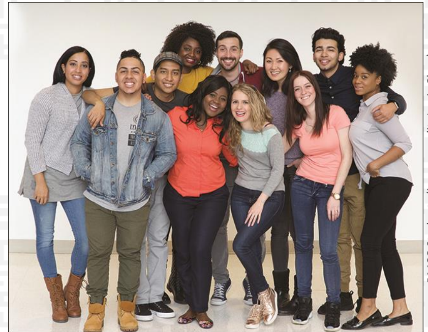
BMCC Students

The projects included in this presentation are funded with grants from the Institute of Museum and Library Services (RE-252364-OLS and RE-250024-OLS-21).