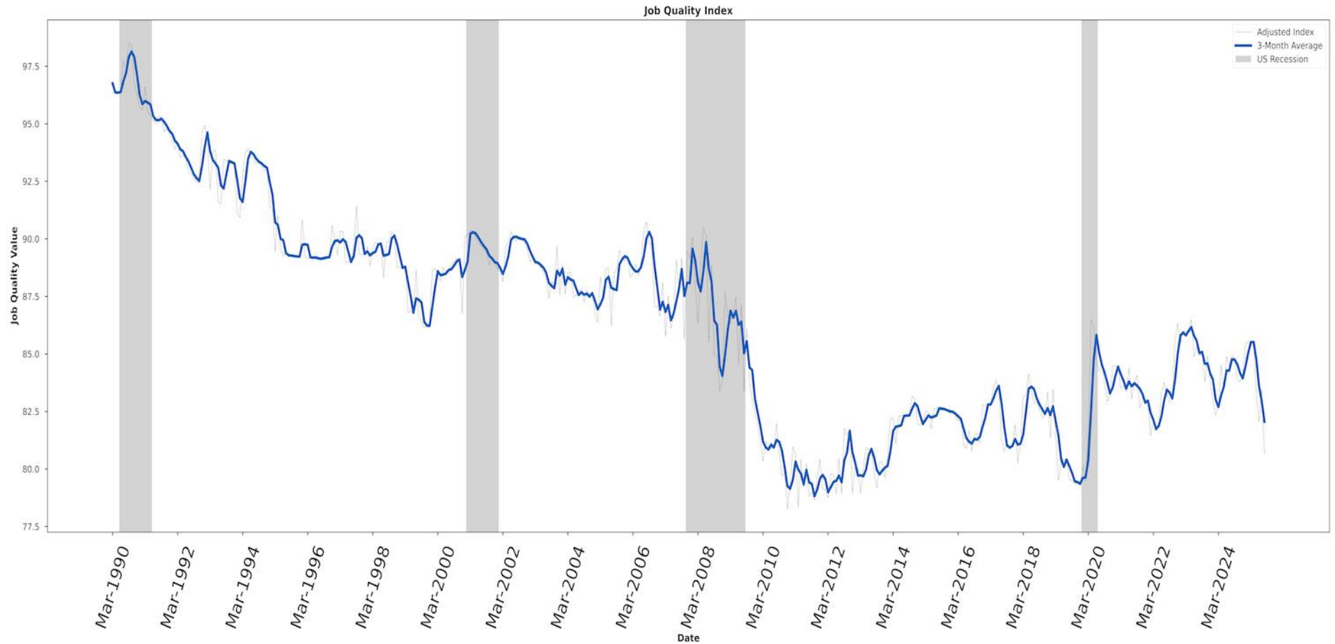
Chart 3: The U.S. Job Quality Index from Inception to August 2025 (Reported as 3-month moving average, monthly readings in blue, recessions shown in grey)