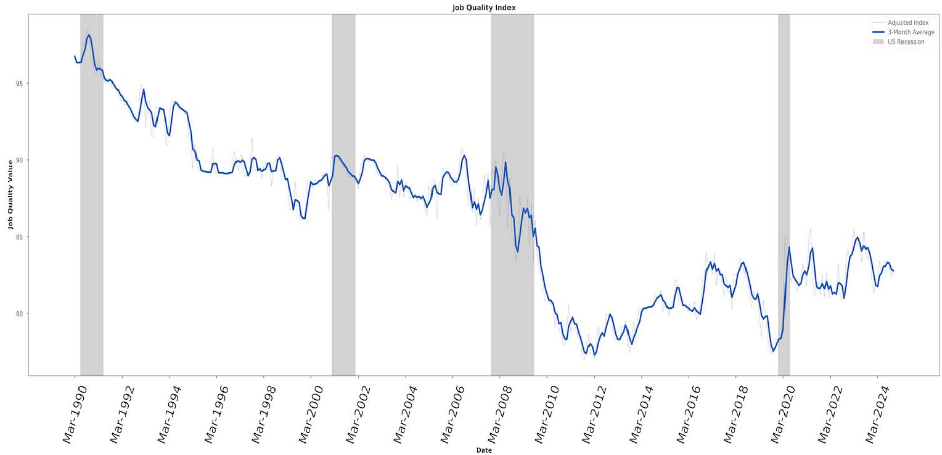
Chart 3: The U.S. Job Quality Index from Inception to October 2024 (Reported as 3-month moving average, monthly readings in blue, recessions shown in grey)