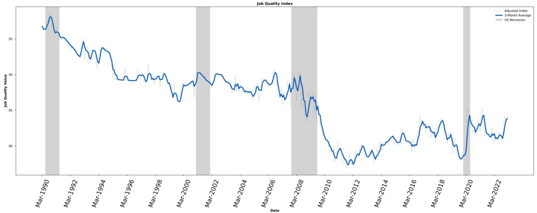
Chart 3: The U.S. Job Quality Index from Inception to March 2023 (Reported as 3-month moving average, monthly readings in blue, recessions shown in grey)