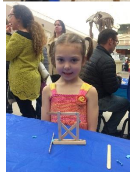
Kids showing their structures proudly