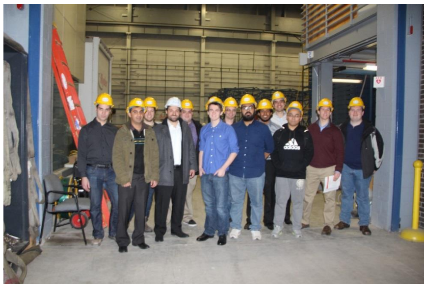
Tour of the SEEL Lab at the University of Buffalo, SUNY