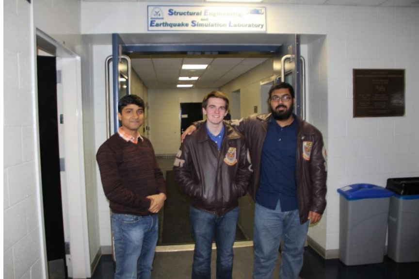
Ph.D. student from UB conversing with students from McMaster University