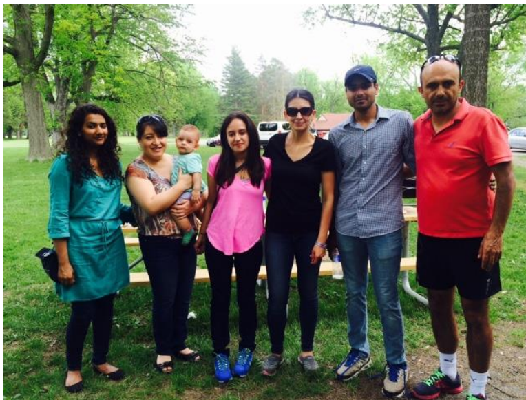
Students and their families during CSEE End-of-Year BBQ