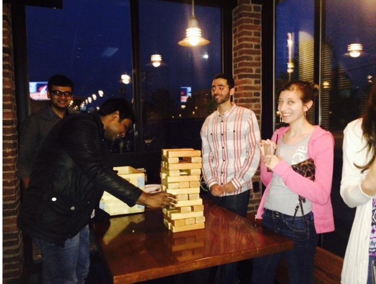
Students and alumni playing Jenga at Brickhouse Taver + Tap

After finals, at the end of the Spring semester, there were two events that brought together the graduate students to celebrate the start of the summer. These activities, a night out at a bar/restaurant and a bbq for the CSEE students, were cosponsored by the CSEE graduate student.