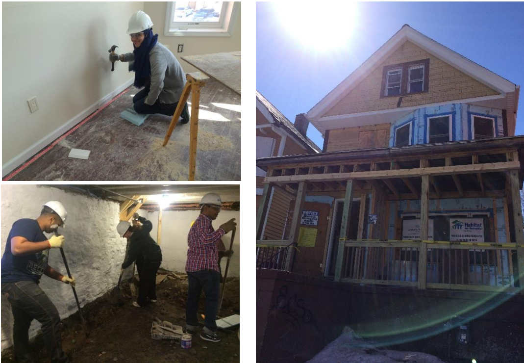
Graduate students helping with the renovation of the house

The UB-EERI student chapter volunteered on Saturday, March 28th with the Habitat for Humanity in Buffalo to help with the renovation of a house.