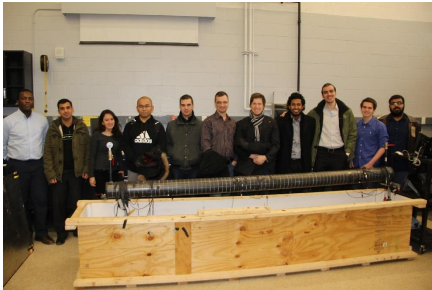
Tour of the Smart Structures Research Laboratory at the University of Buffalo, SUNY

research; this included a question and answer session per presentation. During the graduate student presentations, the undergraduate team members from the seismic design at each university had a meeting and discussed their ideas. This was indeed a great event to network as well as to learn from what other students are working on.