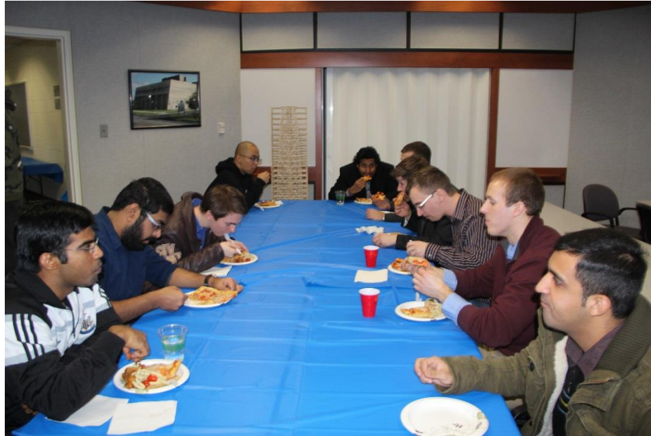
Students from both universities networking during lunch