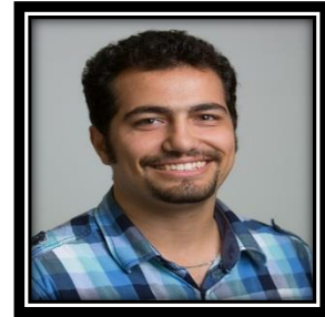
Arvin Ebrahimkhanlou Senator